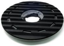
Pad Holder floor pads