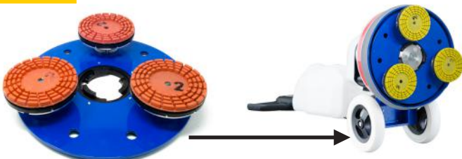
Plate with 3 Satellit