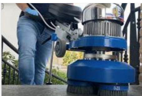
COUNTER ROTATING PLANETARY INCREASES THE PERFORMANCE