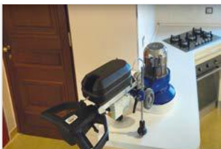
GREAT STABILITY ON EVERY SURFACE

Numerous accessories to make the Atom 330 single disc machine or grinder / polisher.