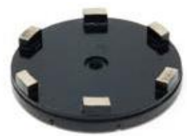
GM Diamond disc