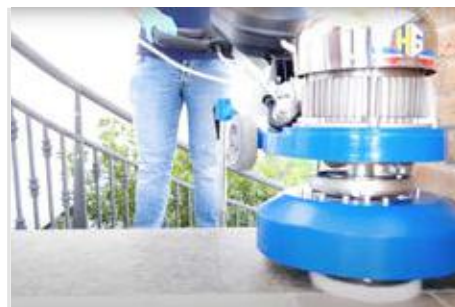
COMFORTABLE AND EASY TO USE