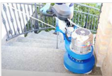
NO MORE PAIN TO POLISHING STAIRS