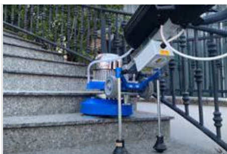
INDEPENDENT SPHERICAL WHEELS