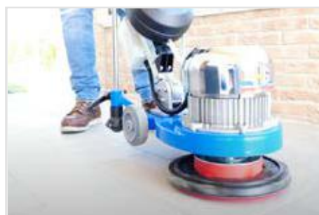
DRY AND WET APPLICATION